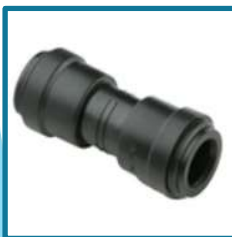
REF. 1115-1515 TAM. 15mm DESC. Union Connector