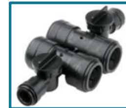
REF. 1183-1815 TAM. 15mm DESC. Dual Union Body