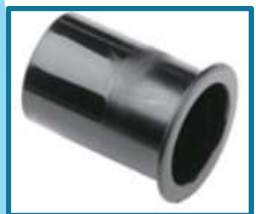
REF. 1146-18 TAM. 1" Cts DESC. End PLugs