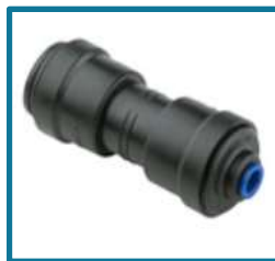
REF. 1116-1015 TAM. 15mm x 1/4" DESC. Reducing UNion