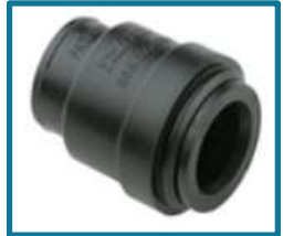
REF. 1145-15 TAM. 15mm DESC. End Stops