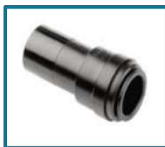
REF. 1114-2215 TAM. 22mm DESC. Reducing Stems