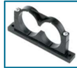
REF. 1180-18 TAM. Dual 15mm DESC. Dual Side Mounting Kit