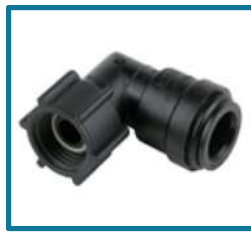
REF. 1120-0815 TAM. 15mm x 1/2" DESC. Female Swivel Elbow