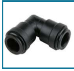
REF. 1117-1515 TAM. 15mm DESC. Union Elbow