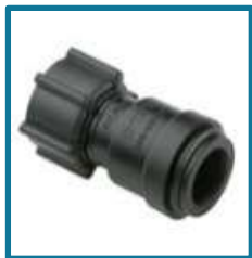
REF. 1110-0815 TAM. 15mm x 1/2" DESC. Female Swivel Connector