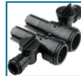
REF. 1184-1815 TAM. 15mm DESC. Dual Stem Body