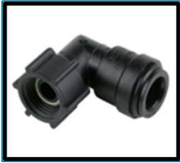
REF. 1110-0815 TAM. 15mm x 1/2" DESC. Female Swivel Connector