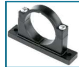
REF. 1181-18 TAM. 15mm DESC. Single Side Mounting Kit