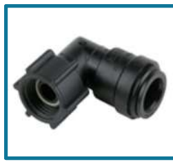
REF. 1120-1215 TAM. 15mm x 3/4" DESC. Female Swivel Elbow