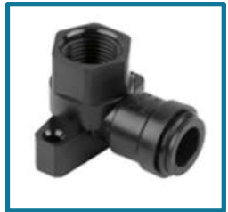
REF. 1121-0815 TAM. 15mm x 1/2" DESC. Drop Ear Elbow