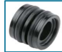
REF. 1182-18 TAM. 15mm DESC. Divider Plug