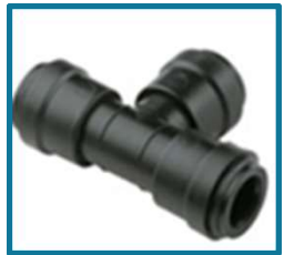
REF. 1123-1515 TAM. 15mm x 15mm DESC. Union Tee