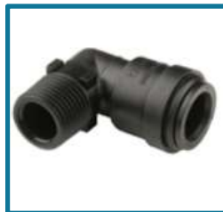
REF. 1119-0815 TAM. 15mm DESC. Male Elbow