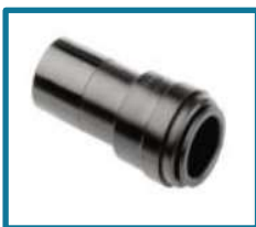
REF. 1114-1815 TAM. 15mm DESC. Reducing Stems