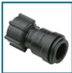
REF. 1110-1215 TAM. 15mm x 3/4" DESC. Female Swivel Connector